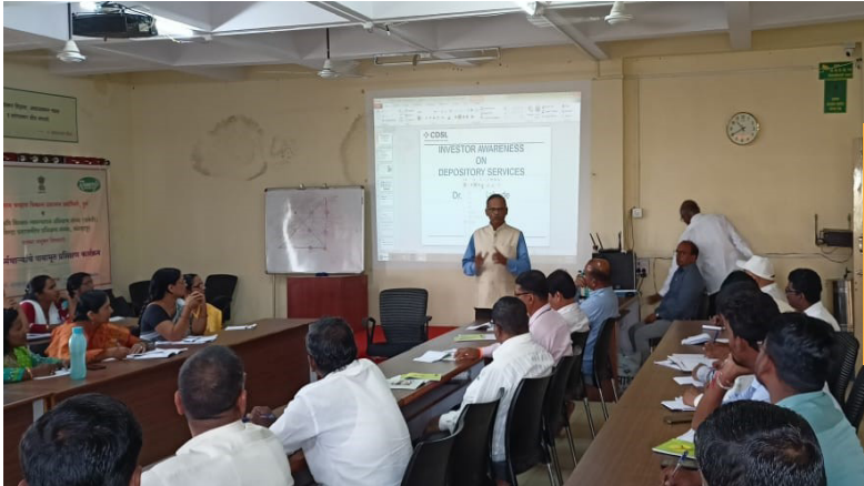
IAP conducted at Kolhapur for agriculture officers in RAMETI (Regional Agriculture and Marketing Training Institute) Govt of Maharashtra.

IAP conducted at Shri Guru Nanak Girls Degree College Lucknow, Uttar Pradesh.